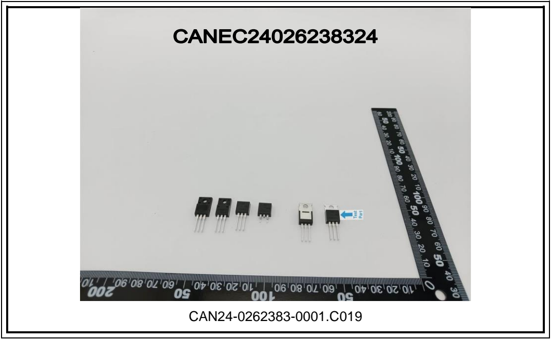
SGS authenticate the photo on original report only *** End of Report ***